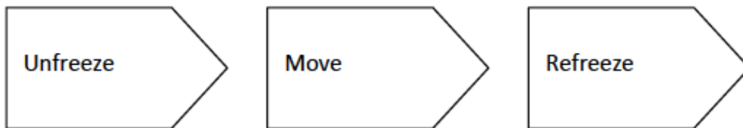
Figure 1: Lewin's model of change