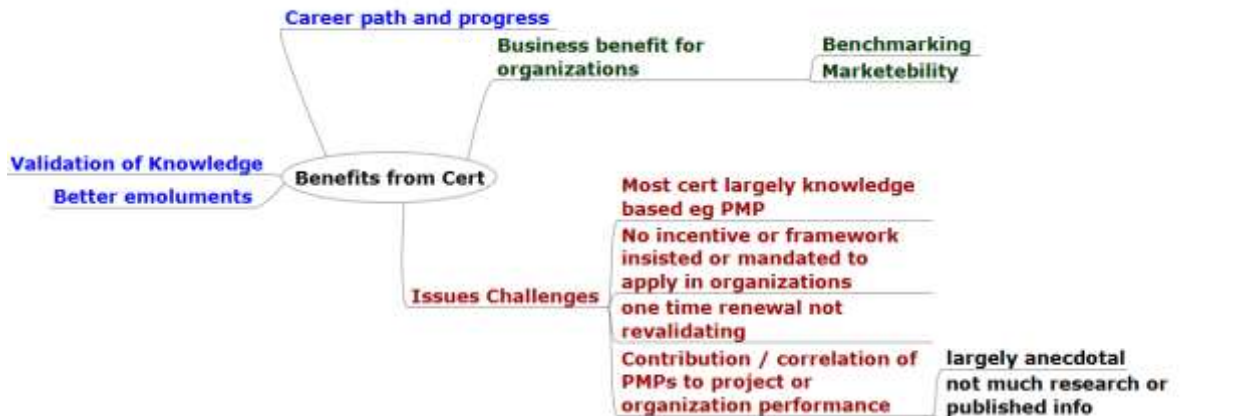
Exhibit 2 – Benefits from Certification

What do organizations look for as benefits in a certification or when they hire certified professionals? Ideally, they should be linking it with organization’s objectives whether they are financial, marketing , technical excellence etc or at the minimum to project outcomes like scope, time and cost .Personal experience has been that this is hardly the case. In most situations the effort stops at attending training programs or knowledge sharing sessions. There has been next to no research in this area - one which is clearly central to the whole argument for the associations as professional bodies.(5)