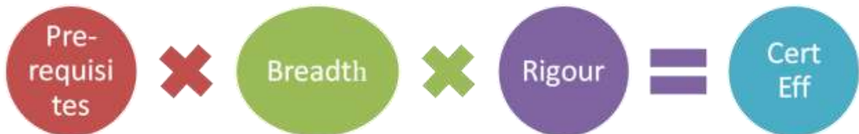
Exhibit 1 – Certification Effectiveness

What criteria should we consider to assess the value of a certification? An interesting analysis has been done (3) using parameters like level of effort to obtain a credential (pre-requisites) , extent of coverage of content( breadth) and methods of assessment to get certified (rigor). Certification effectiveness is calculated as a product of pre-requisites, breadth and rigor.