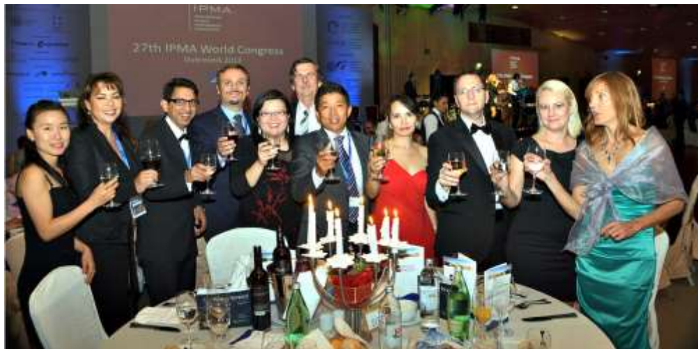
2013 Award winners in Dubrovnik, Croatia

Do not miss this great opportunity to benchmark your project work, award your team and receive the IPMA Project Excellence Award 2014– Oscar in Project Management world .